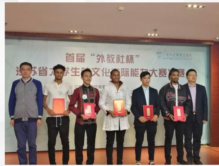
Intercultural competence competition