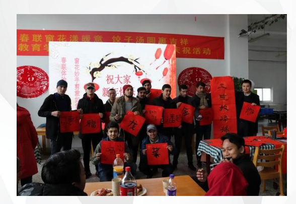
Write spring festival couplets